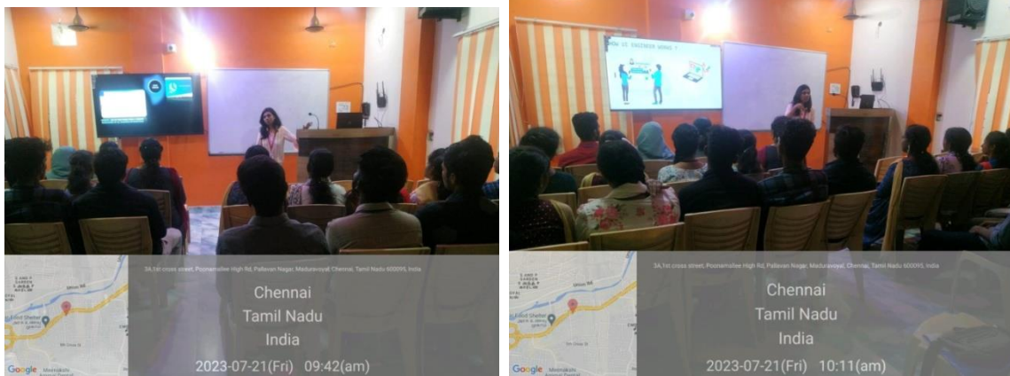
Snapshot of the Session on “Web Development”