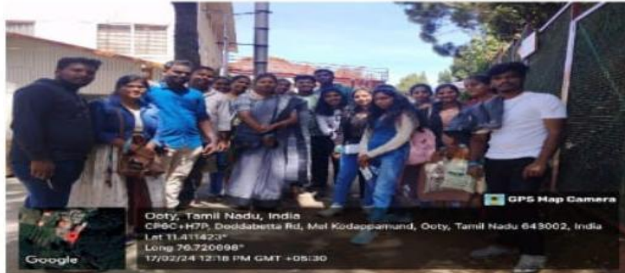
Faculty and Students Visited Tea Factory, Doddabetta

PG & Research Department of English organised an Educational Tour to Ooty for two days ( 17.02.2024 & 18.02.2024) for 28 students of I MA English & II MA English along with two Department Faculty. They were taken to Tea factory,Doddabetta to see the process of making Tea Powder.They visited Botanical Garden and Lake to grasp the writings of the Lake Poets.They witnessed the influence of British Architecture in the buildings of Ooty. This Educational Tour paved way to explore the stream of Food Literature and Eco-Literature for the students.