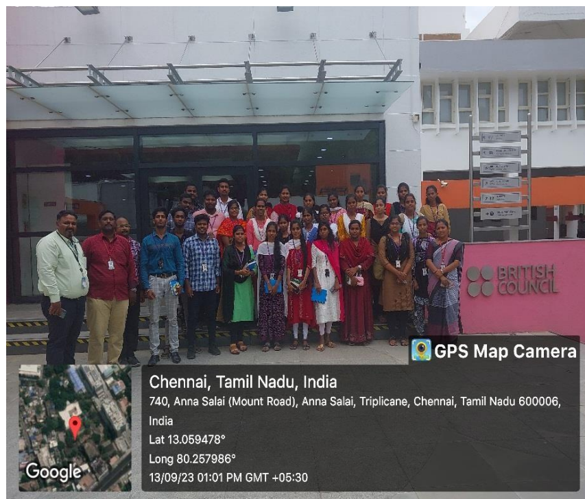
Group Photo of the Team in the British Council