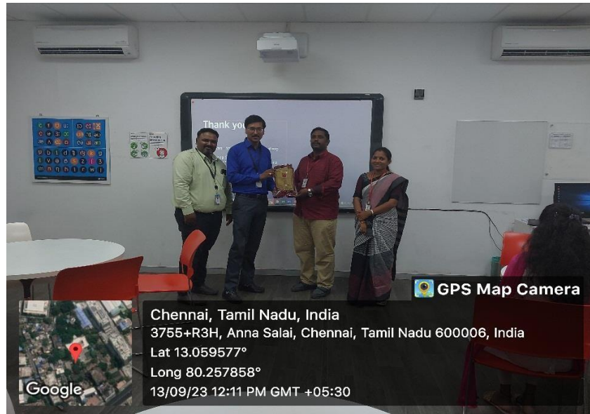
Felicitation of the Librarian