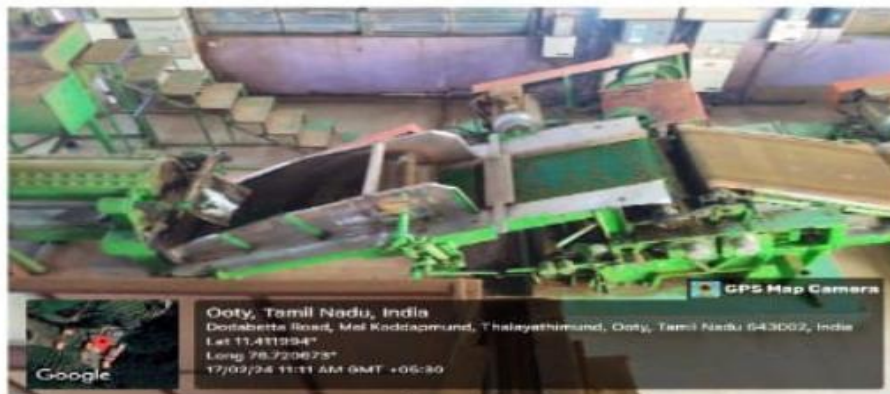
Process of Tea Powder Making