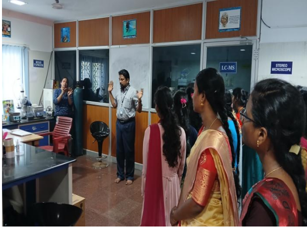
Lecture by In charge of CAS