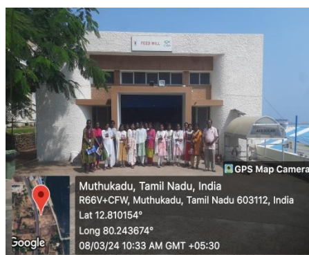
View of Feed Mill