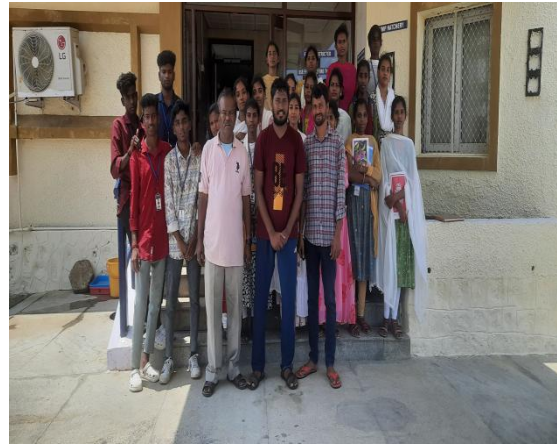
Students visited in Culture unit