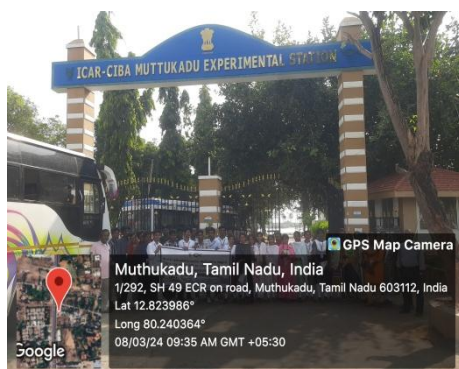
Entrance of CIBA