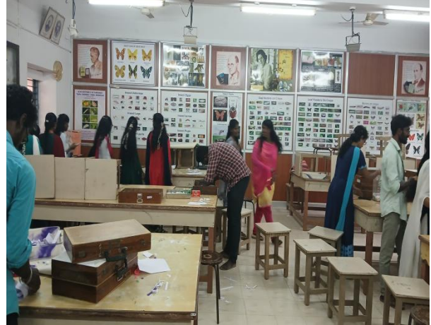
Students specimen collection in lab