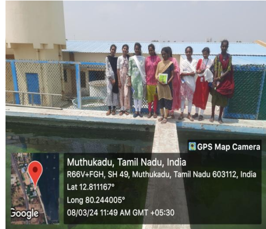
Students visited fish hatchery