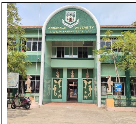
Entrance of CAS