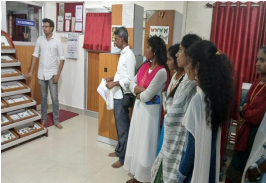
Demonstration by Entomologist