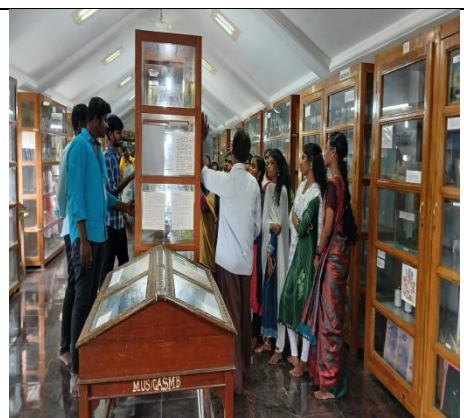
Students visited Museum