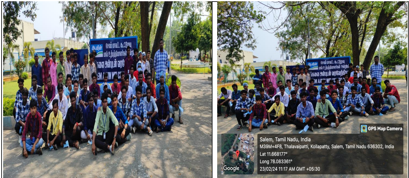
Students at the Aavin Co-operative Milk Producer's Union Ltd, Salem.