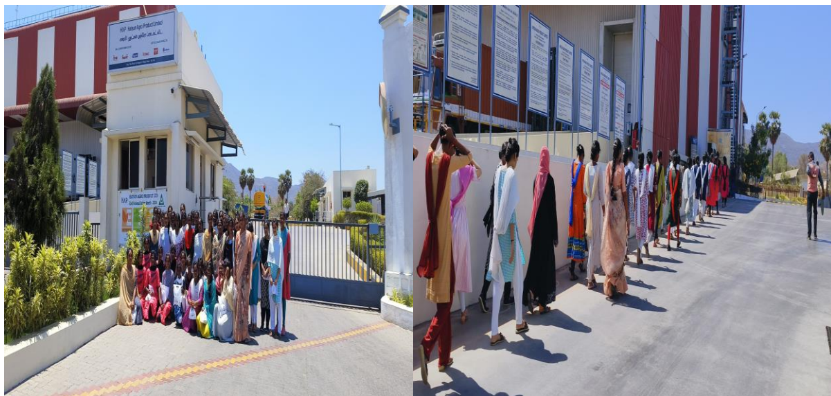
Students at Hatsun Agro Products Limited