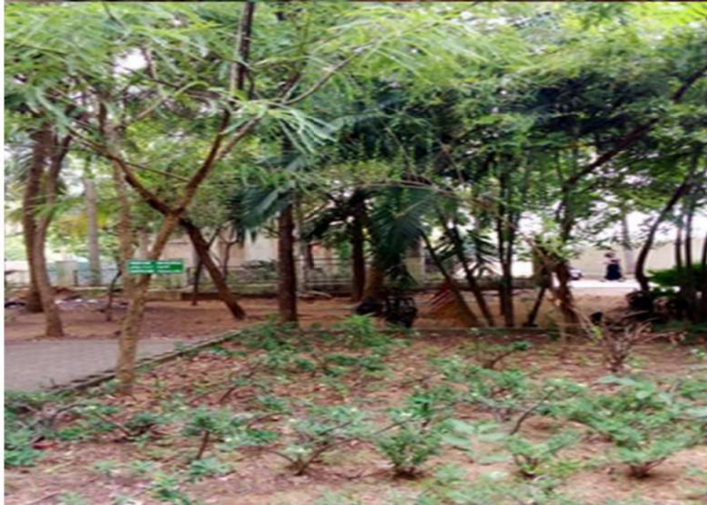
A Glimpse of green cover in the campus