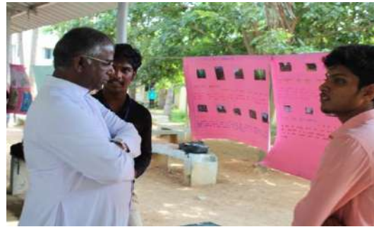
Rev.Fr.Secretary asking questions with students