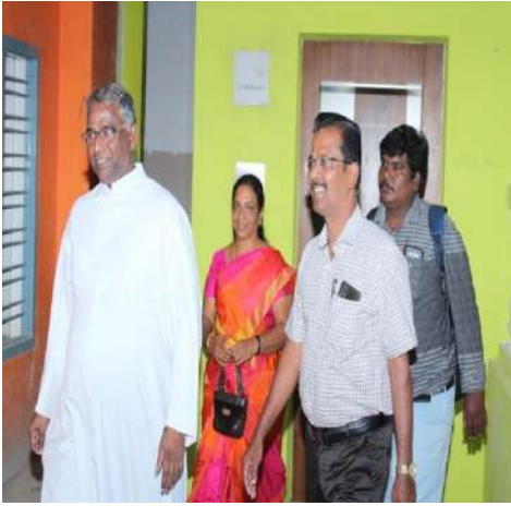
Rev.Fr.Secretary with the guest