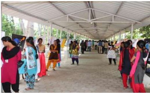
Students presented their poster in coconut grove