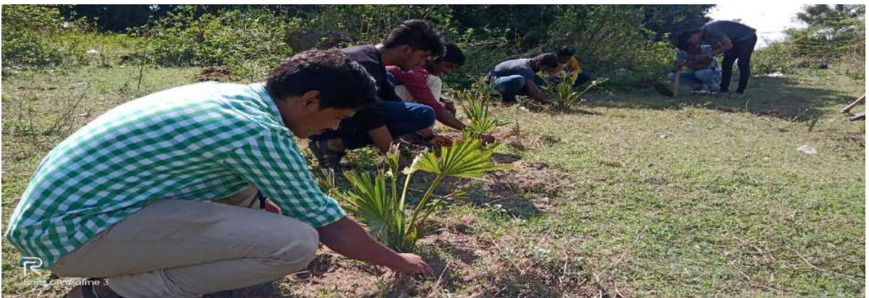
Students are planting Palm tree saplings