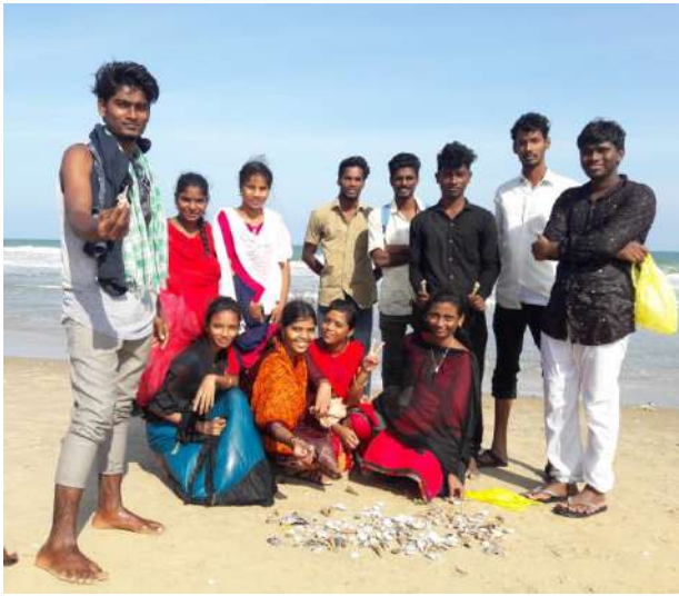
Students collecting the different types of shell