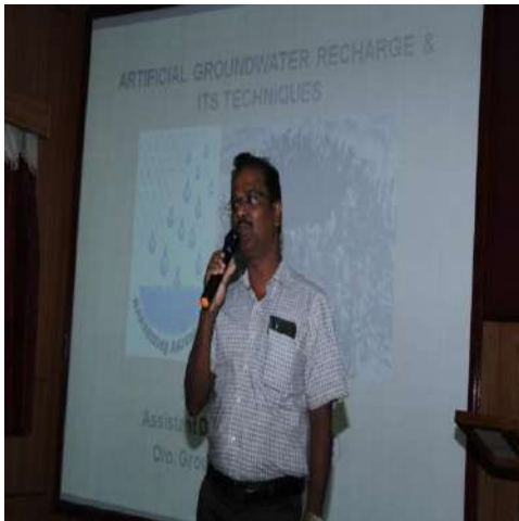
Key note address by the Guest