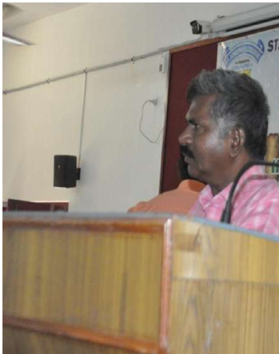
Address by principal