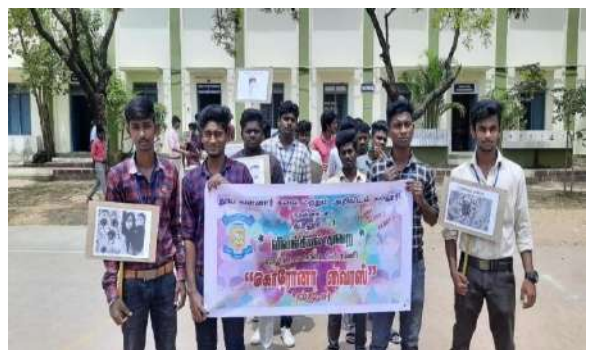
Student's Rally near Venmani Block