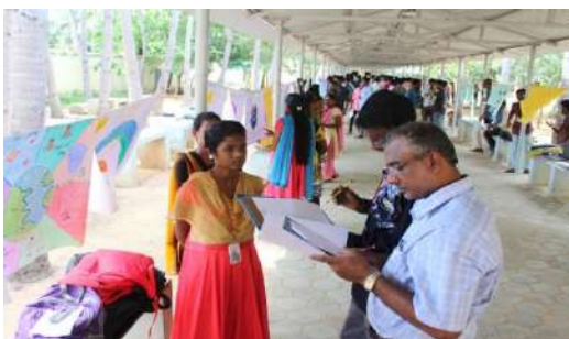
Judges of the event met the students