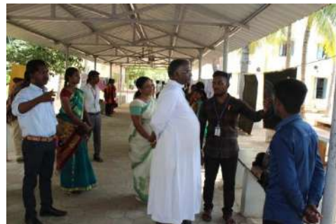
Rev. Fr. Secretary met the students