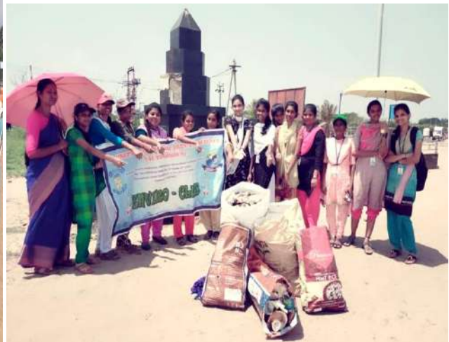
Students after collecting the garbages