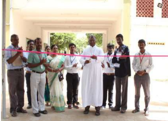
Ribbon cutting by Rev.Fr.Secretary