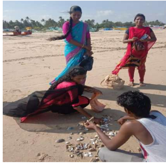
Students arranging the different types of shells