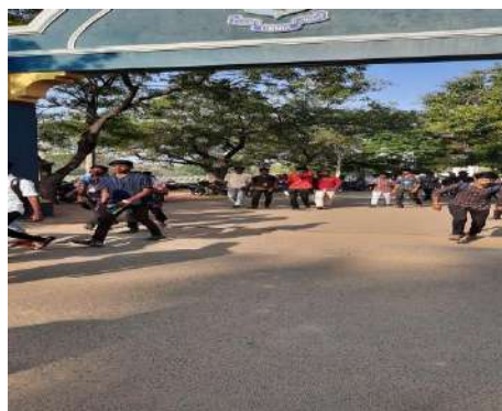
Students are coming by walk