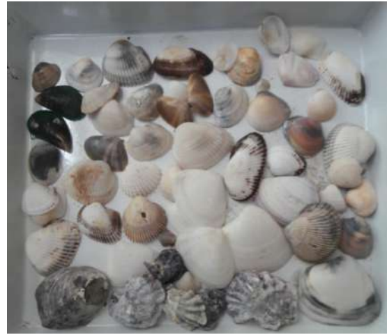
Shell collection displayed