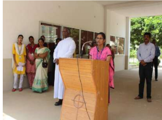
Student's Talk about Ozone Day