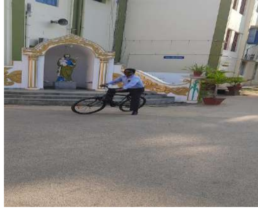
Principal of the college came by bi-cycle