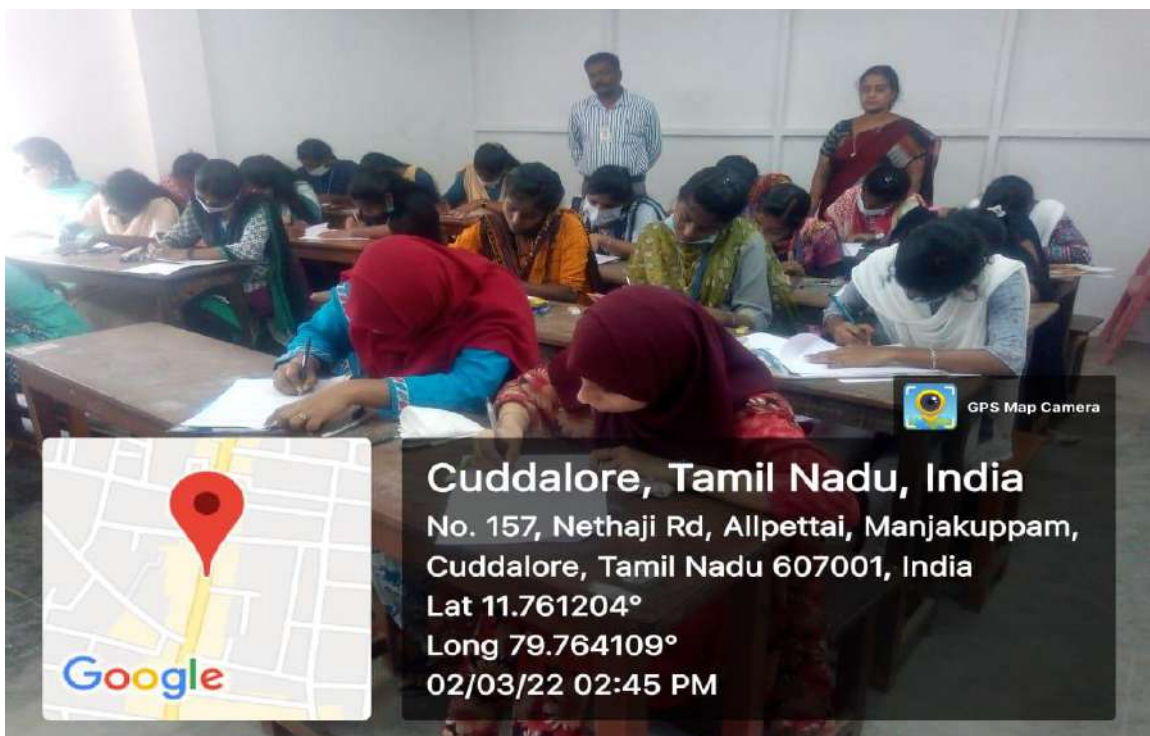
Competitions conducted for the students