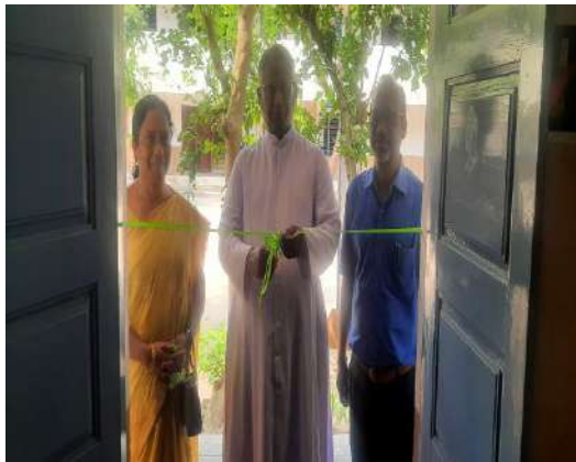
Shift-II Inaugurated by Rev.Fr. Secretary