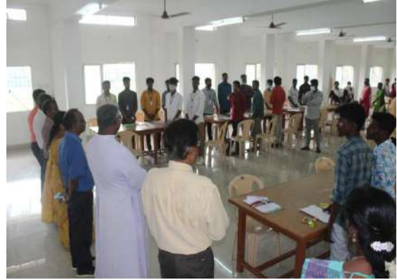
Students presentation for sShift-I