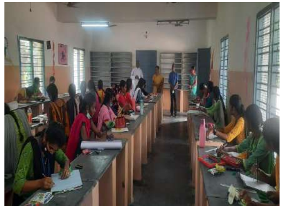
Students presentation for Shift-II