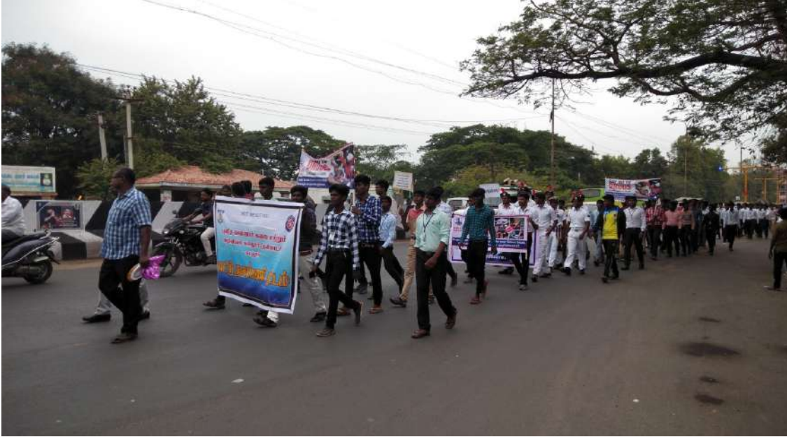
Anti - Drug Awareness rally moving through various places