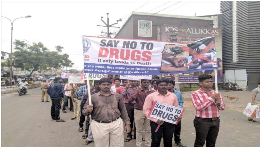
Anti - Drug Awareness rally on the move