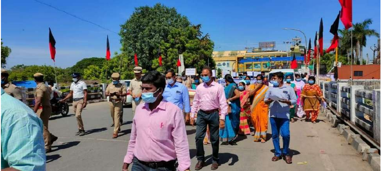
Awareness Rally against Drug usage & Drug trafficking, moving through various places