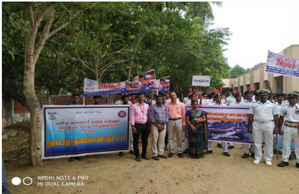
Anti - Drug Awareness rally successfully completed by NSS, NCC, RRC, and YRC volunteers