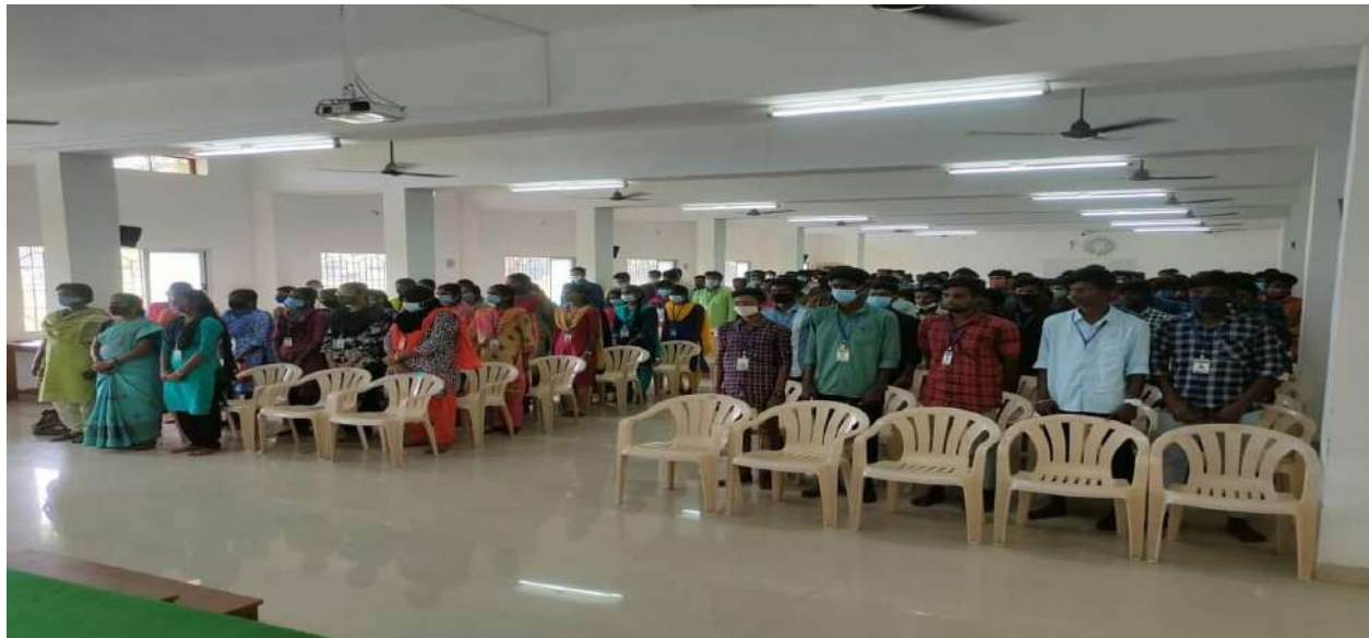
Students actively participated, and over 100 students benefited from the session