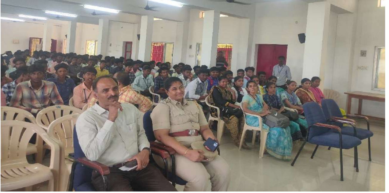
More than 100 students participated in the programme.