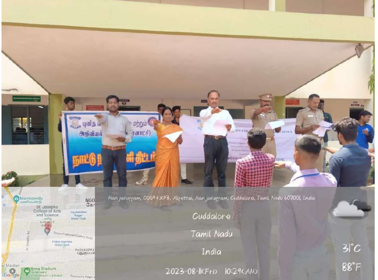
Students were taken the pledge during Assembly.