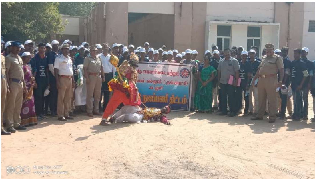
The Police Department also arranged a drama performance for public welfare.