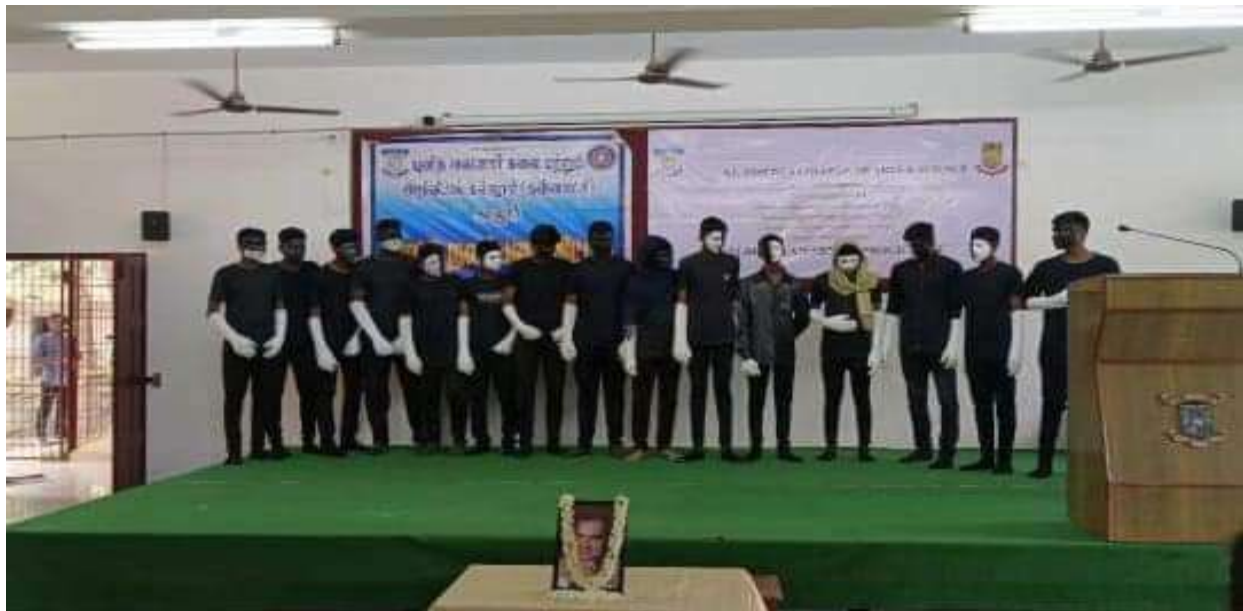
Students staged Mime Performance against Drug usage