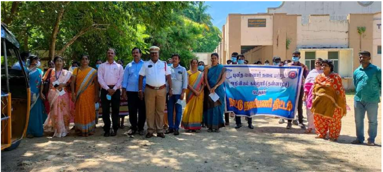
Awareness Rally against Drug usage & Drug trafficking, successfully completed by NSS volunteers