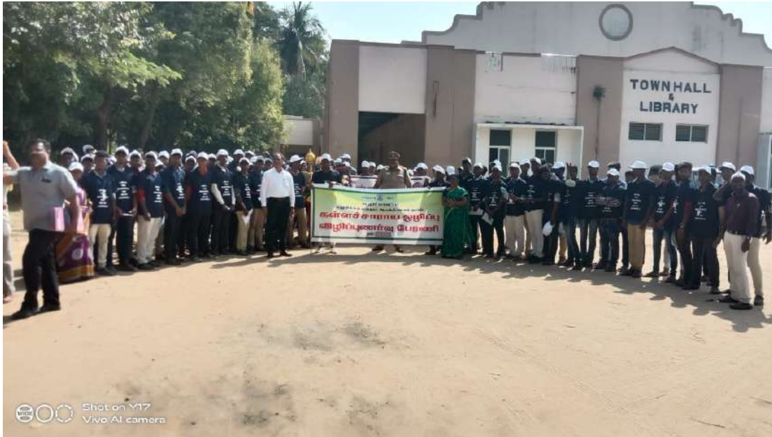
Awareness Rally against illicit liquor trade & alcohol consumption, successfully completed by NSS volunteers