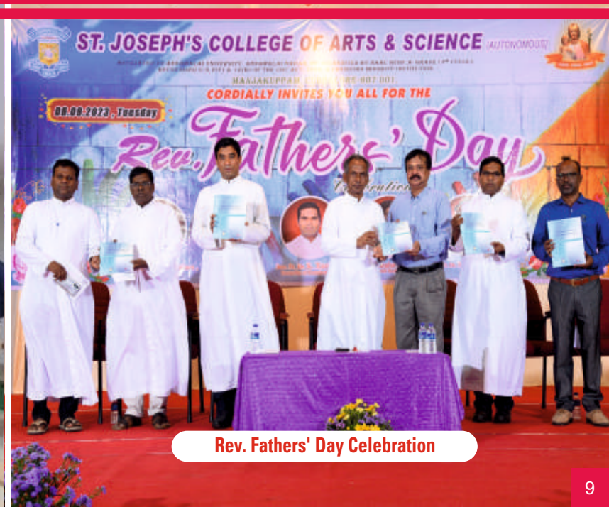
Rev. Fathers' Day Celebration