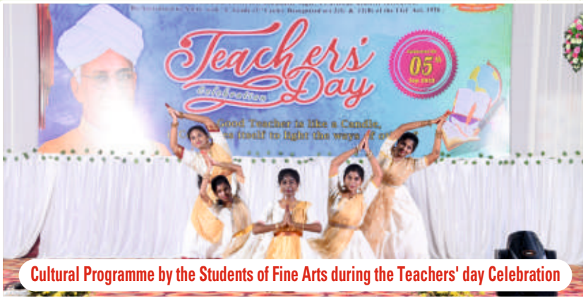
Cultural Programme by the Students of Fine Arts during the Teachers' day Celebration