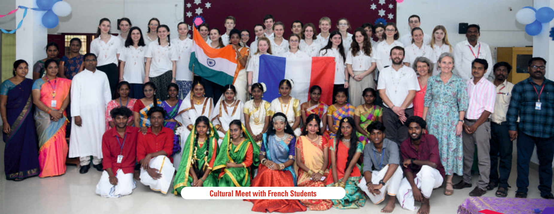
Cultural Meet with French Students