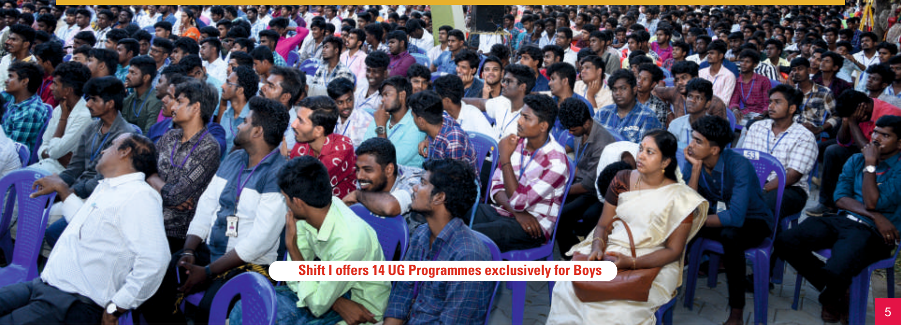
Shift I offers 14 UG Programmes exclusively for Boys