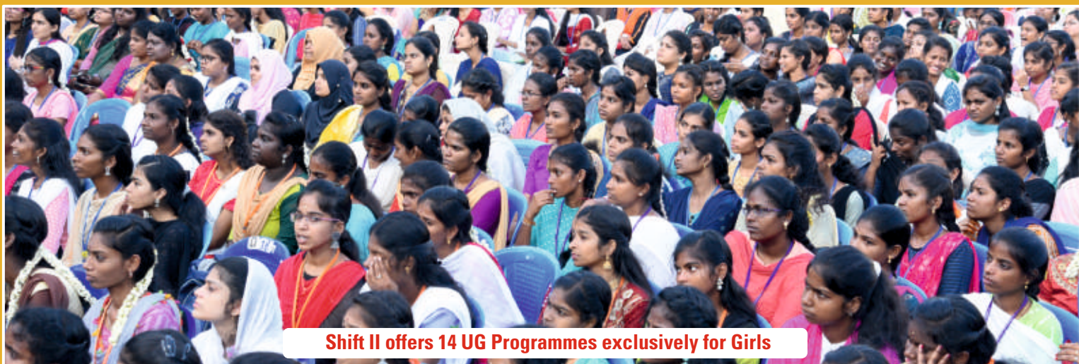
Shift II offers 14 UG Programmes exclusively for Girls

We expect high standards of behaviour and a sense of responsibility and self-discipline in our students. We instil the key values of Pride and Respect, which is a constant theme of assemblies and our Spiritual, Moral, Social and Cultural development programme.