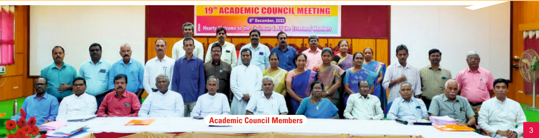
Academic Council Members