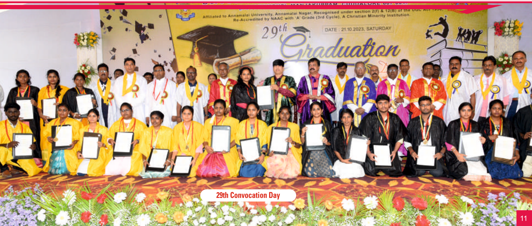
29th Convocation Day

THE COLLEGE DOES NOT ACCEPT DONATION in any form for admission. Any issue in this regard may be brought to the notice of the college authorities immediately.