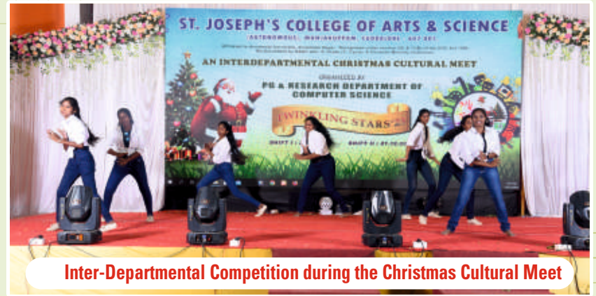
Inter-Departmental Competition during the Christmas Cultural Meet