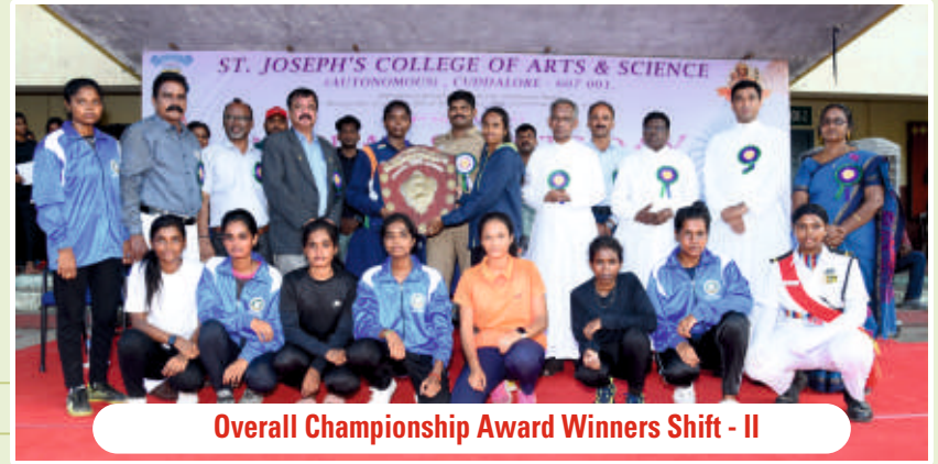
Overall Championship Award Winners Shift - II