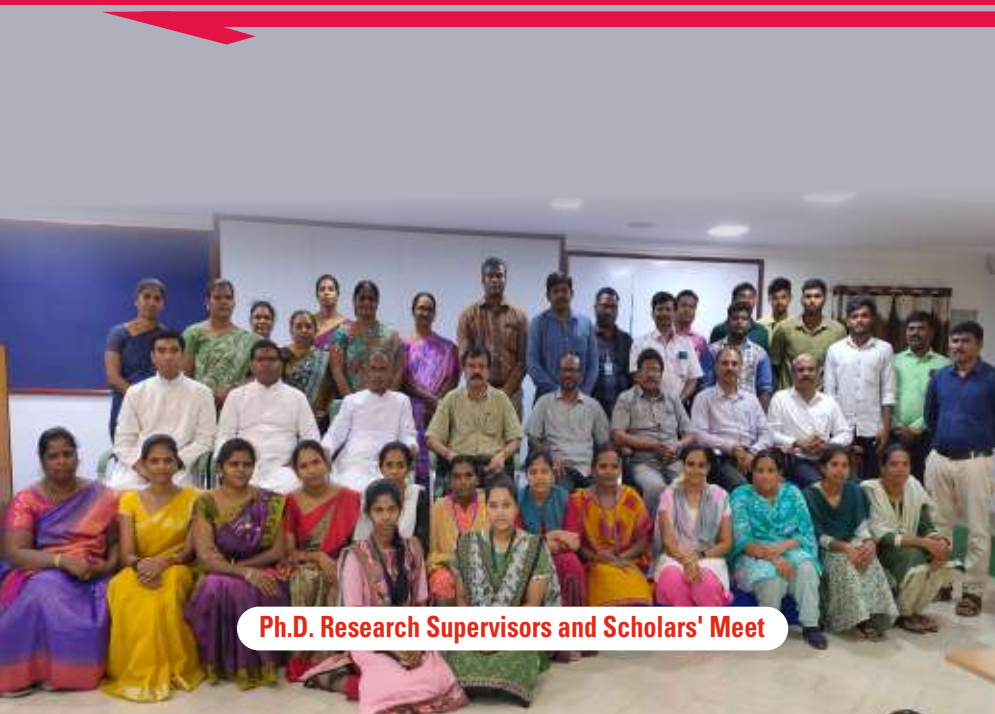
Ph.D. Research Supervisors and Scholars' Meet

A variety of Under Graduate, Post Graduate and Research (Ph.D.) Programmes in Arts, Science and Commerce is offered @ St. Joseph's