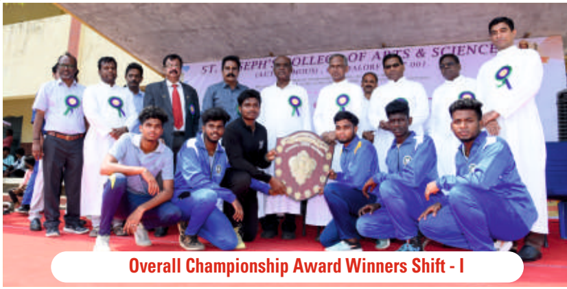
Overall Championship Award Winners Shift - I