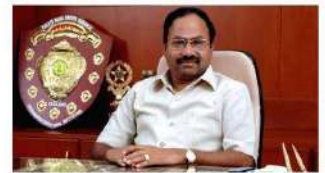
Chairman & Secretary

Elayampalayam - 637 205. Tiruchengode, Namakkal Dt., Tamil Nadu.